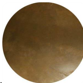
After one pass polishing