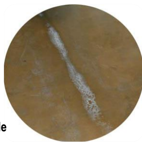
After 4 hours