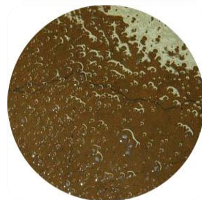
Applied KF-G remedial slurry