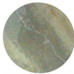
Concrete crack > 2 mm