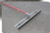
Application KF-G remedial slurry